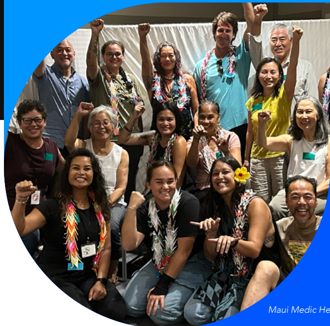
Maui Medic Healers Hui

Below we invite you to learn more about our grantee partners and their challenges and successes. The handful of grantee profiles included here highlight the diversity of community approaches to organizing around environmental justice. The full list of approved grants in 2023 can be found at the end of the report.