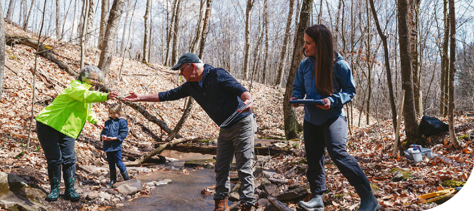
West Virginia Rivers Coalition